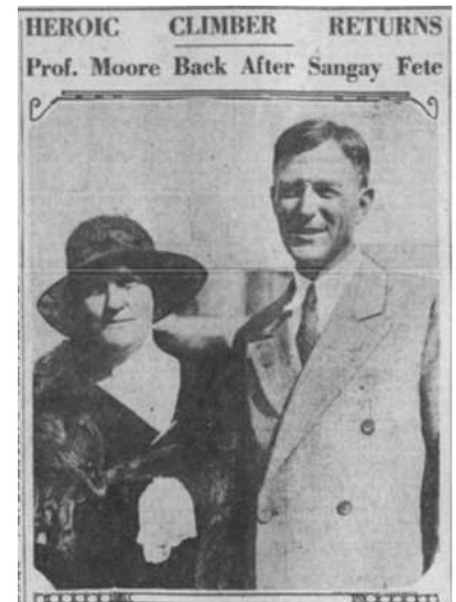
Los Angeles Times 1929

Speaking of color, Dr. McCormack took us briefly through the biology of color in bird feathers. Many of the colors are based on colored pigments such as melanins. Melanins absorb light and, depending on the specific melanin and its concentration, we may see deep black to subtle grey or combinations of these with red and yellow melanins to form various colors from deep red brown to pale yellow. Another class of light-absorbing pigments found in bird feathers are the carotenoids that produce specific characteristic colors, typically bright reds oranges and yellows. Unlike melanins which are synthesized by cells in the skin, carotenoids that produce color in bird feathers come from plants algae and fungi in their diets although, in some cases birds have the capacity to modify a carotenoid-precursor that they have eaten into the specific carotenoid (continued next page)