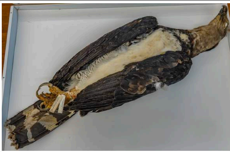
The massive Harpy eagle takes up its own drawer.

See the amazing Harpy eagle talons, the largest of any living eagle, which it uses to snatch tree-dwelling mammals such as monkeys and sloths that are present in tropical lowland rainforests from Mexico to Brazil and Argentina. In fact, the bird is so strong that it can lift prey with weight equal to its own. Unfortunately, the Harpy eagle is succumbing to habitat-loss due to unrestrained logging throughout its territory and is almost extinct in Central America with the exception of some