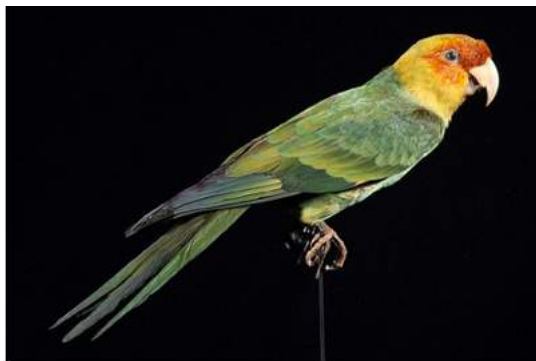
Picture of a mounted specimen of the Carolina Parakeet or Carolina Conure