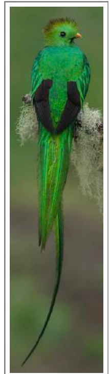
Resplendent Quetzal in Costa Rica.