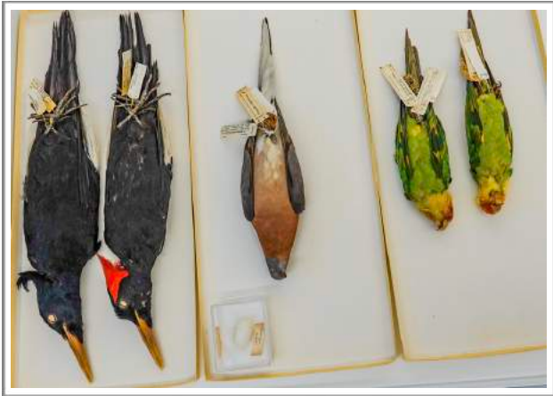
Imperial Woodpecker, Passenger Pigeon and Carolina Parakeet The only birds in the Moore Lab collection that are extinct in the wild.

Birds, numbering perhaps in the billions, migrated in flocks that darkened the skies for hours and generated sounds likened to "a thousand threshing machines running under full headway, accompanied by as many steamboats groaning off steam, with an equal quota of R.R. trains passing through covered bridges." In less than a century, the bird was gone, an extinction that shocked the nation, an impossibility because the numbers of birds had been so large.