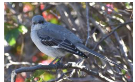
Northern Mockingbird, 2021 CBC.

Record highs were achieved by Egyptian Goose, Allen's Hummingbird, Turkey Vulture, Red-naped Sapsucker, Pacific-slope Flycatcher, Common Raven, Canyon Wren, and Scaly-breasted Munia. Second-highest totals were achieved by Eurasian Collared-Dove, American White Pelican, Red-tailed Hawk, Peregrine Falcon, Vermilion Flycatcher, Cassin's Kingbird, Orange-crowned Warbler, & Yellow-rumped Warbler, and third-highest totals went to Cackling Goose, Yellow-chevroned Parakeet, Nanday Parakeet, Black Phoebe, Chipping Sparrow, & Townsend's Warbler.