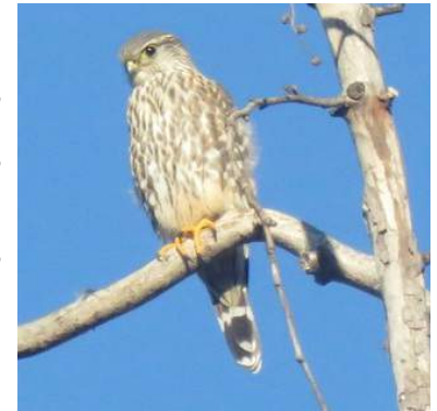
Merlin (Prairie), 2021 CBC.

• 1 Prairie Merlin , seen at Valley Plaza Park. This subspecies ( Falco columbarius richardsonii ) is normally found in the Great Plains, with some wintering around the Rocky Mountains and Great Basin. One or two show up in southern California each year, but this is the first time it has been recorded on our CBC. By contrast, our usual subspecies, the Taiga Merlin ( F.c. columbarius ) has been recorded on 43 of our 65 CBCs, and has only been missed twice in the last 35 years. Three Taiga Merlins were seen this year.