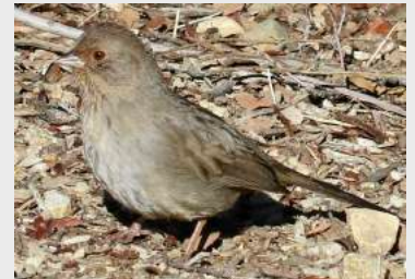
California Towhee