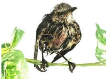
Photo color adjusted to better show contamination

outdoor enclosure to gain strength and become acclimated to the weather. On 10/17/2021 she was released back to her original location in Simi Valley to have a second chance at thriving in the wild.