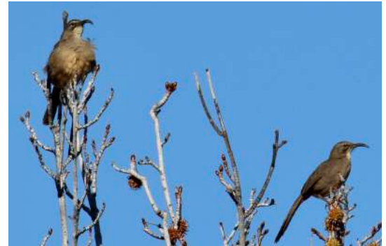
California Thrashers, 2021 CBC.

Loggerhead Shrike numbers remain low. Four were seen this year, about the same as the last few years. A record high of 70 birds were seen in 2000, but they have only shown up in single digits since then. This species requires open grassland to hunt, severely limiting where it can be seen on our count. This year's sightings were more spread out than usual, with the Chatsworth Reservoir, Sheldon-Arleta Park, Sepulveda Basin, and Pierce College all reporting one each (one was also seen at Eden Memorial Park during count week, but this location was closed on count day). While it is almost always reported at Chatsworth and Sheldon-Arleta, this is the first count day record from Pierce College since 2014, and the first one from Sepulveda since 1997 (although it was seen at the adjacent Bull Creek in 2015).