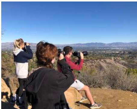
CBC 2021, Marvin Braude Mulholland Gateway Park