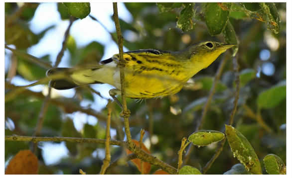
Magnolia Warbler by Alexander Viduetsky

spot. Also, many thanks to Carl, who was extremely helpful with the directions when we were looking together for the Magnolia Warbler earlier that day.