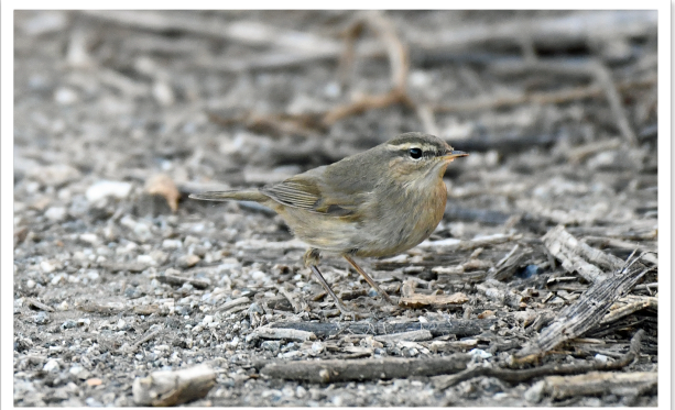
Dusky Warbler

When I arrived to the spot at Sepulveda Basin in the afternoon on October 16, there was already a group of birders there. Thanks to them, I knew exactly where that bird was. It took approximately two hours to get a chance to photograph that Old World warbler in the open. The bird was moving very fast and I had no more than a few seconds to make my photo-shots. Considering that the bird was staying in the shadows most of the time, I had to increase my camera's ISO to 2000 and add 1+ step of exposure compensation to make a sharp enough capture. Even though my photo is far from perfect, it was adequate for the Cornell's Lab application Merlin photo ID (which I have on my phone) to confirm that the bird I had photographed was indeed the Dusky Warbler."