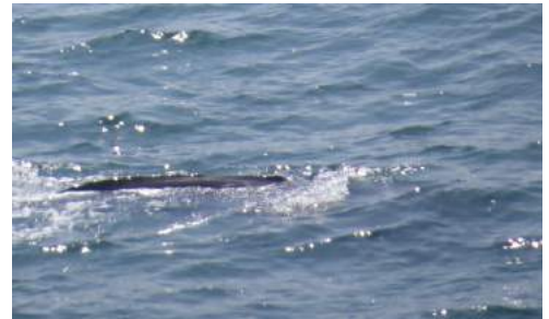
One of the two whales

After the excitement of seeing marine mammals, we were almost blasé about seeing two Willetts (#32) flying low over the ocean below us.