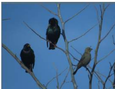
Two Starlings and a Female House Finch

Dozens of Elegant Terns were spooked into flight by a helicopter and settled near the Caspians. A few Royal Terns (#47) then showed up. Three Canada Geese (#48) floated lazily. We reached the beach, where we found a Feral Rock Pigeon (#49) on the sand and six Black-bellied Plovers (#50) on the cobble stones exposed by a still low tide. We turned back toward our car. As we walked inland, a flock of at least 25 Western Sandpipers (#51) flew inland and settled on an island, a couple of Killdeer (#52) among them. A small group of European Starlings (#53) in glossy spring plumage landed in a tree on the colony side of the lagoon fence.