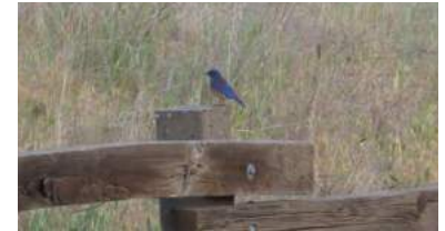
Male Western Bluebird on Low Wood Fence