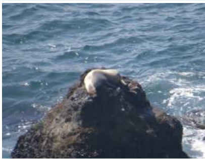
Almost overlooked sea lion napping on a nearby rock

As we walked toward the viewing platform on the side of the headland, a soaring pair of Common Ravens (#29) joined the crows flying high over the beach below. Two Brown Pelicans (#30) sat on the water and were joined by a small flock more. A pair of White-throated Swifts (#31) sliced through the air, twisting, and turning.