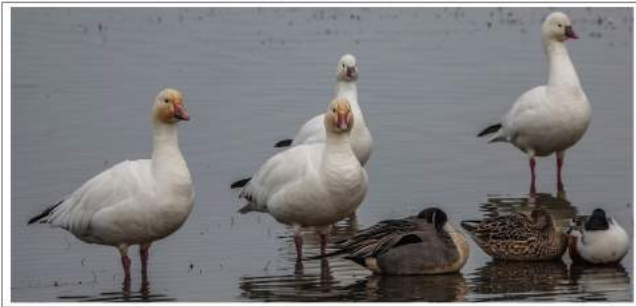
(Snow Goose, Ross's Goose, Pintail, and Northern Shoveler)