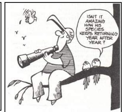
Phainopepla Birdathon Cartoons from the 1980s