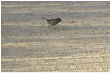
A Different Song Sparrow Seen Later at Legacy Park

I got a bit ahead of Allan on the trail and noticed a coyote at the far end of a field. He was joined by another. Having watched a viral video of a woman attacked by a bobcat in a suburban setting the previous evening, I was a bit nervous until Allan caught up with me. The coyotes were busy hunting for rabbits and ignored us, eventually trotting off.