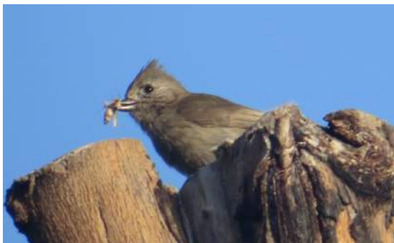
Oak Titmouse Eating Bee Last Year (favorite photo)