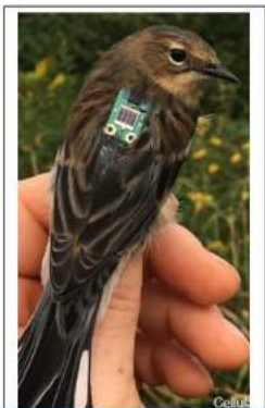
Solar Powered Motus Tag

The SFVAS board has donated $10,000 to the Mono Lake Committee (MLC) to help with its installation of Motus towers to monitor migrant birds of the Pacific Flyway. MLC is a non-profit citizens' group dedicated to protecting and restoring the Mono Basin ecosystem, educating the public about Mono Lake and the impacts on the environment of excessive water use.