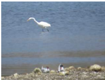
Caspian Terns Ignoring Great Egret Who Doesn't Care

A shorebird called Greater Yellowlegs (#44) flew over the lagoon, calling. Another shorebird, a lone Whimbrel (#45) stood on the beach.