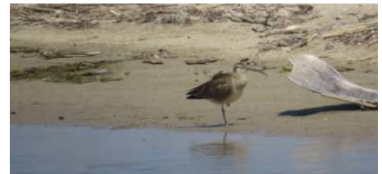
Why is this Whimbrel standing on one leg?

1:10 PM, Malibu Lagoon: Song Sparrows serenading us as we got organized was a good sign, although the separation of the spotting scope into two pieces was not. At least it kept together for the Merlin. Once we got to the path, we immediately found American Coots (#34) , Gadwalls (a kind of duck) (#35), and Double-crested Cormorants (#36) . As we neared the main viewing platform, we saw Heermann's Gulls (#37) on the sandbar before the beach. Three Snowy Egrets (#38) fished in the shallow water on the Adamson House side of the lagoon. As we turned back along the path, a pair of Lesser Goldfinches (#39) flitted among the sycamores close to the highway. Caspian Terns (#40) flew in and joined several others that were resting on a small island. A Wrentit (#41) sang, allowing us to find him moving about in the middle of a densely leaved little bush next to us. A pair of little Pied-billed Grebes (#42) swam and dove in the center of the lagoon. A Great Egret (#43) stretched its long neck over the shallow water, intently looking for fish around to grab for lunch.