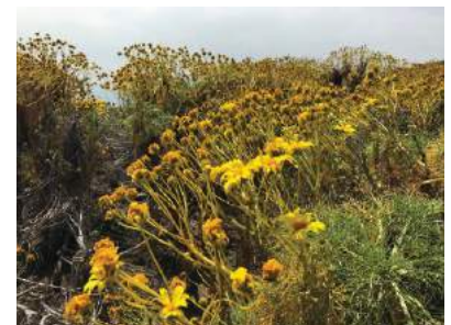
Stand of Giant Coreopsis with Carrot Top Leaves

The giant coreopsis flowers, a feature for which the Pt. Dume Headlands are known, were largely spent, but it was amazing that they were able to blossom at all after