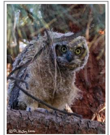
Do I know you?

Springtime visitors to the Sepulveda Basin Wildlife Reserve get to experience and enjoy the wonder of bird reproduction in many of its varied forms. There's something very special about the Great Horned Owls: unlike most nesting birds whose babies are up and out in almost no time, we get to watch owlets and cheer them on as they grow, develop personalities and hone their skills.