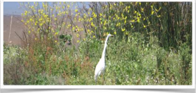
Great Egret Looking for Lunch

fish there and moved to the close side of the wetland, where it looked for land critters to dine on.