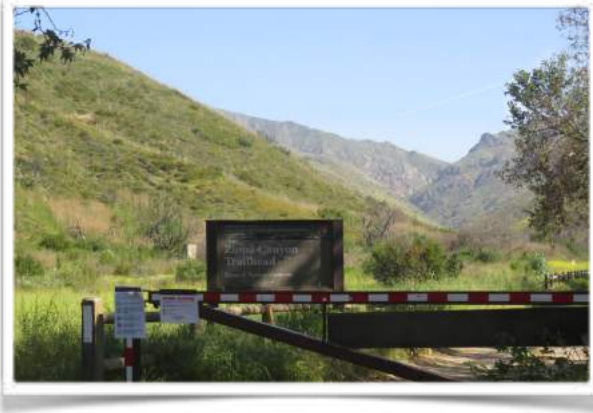
Closed Gate and Where We Turned Back Toward Car

paving on Bonsall where the entrance to the Lower Zuma Canyon Trailhead begins, we started to hear clear birdsong tones rise and fall, over and over. We should have been able to identify it, but our memories and imaginations failed us. Finally, I got a quick glimpse of an orange bird with a black head: a male Black-headed Grosbeak, #28 . It disappeared into the field next to the dirt road we couldn't enter, but we knew what species we had heard singing.