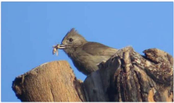
Oak Titmouse Eating Bee

larger jays. Seeing the Titmouse eating was an early highlight of the Birdathon which was to include other birds Allan photographed while they ate.