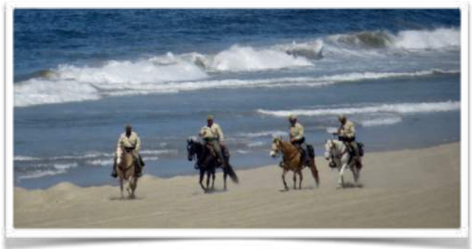
Part of the Posse, 2020 Style

Around the time we stopped seeing whales, surfacing, spouting, diving and spy hopping, we were bemused to see a posse of seven mounted sheriff's deputies on the sand of Zuma Beach, heading toward Westward Beach. Apparently, they were part of the effort to keep people off the beach so that they wouldn't infect each other with the coronavirus.