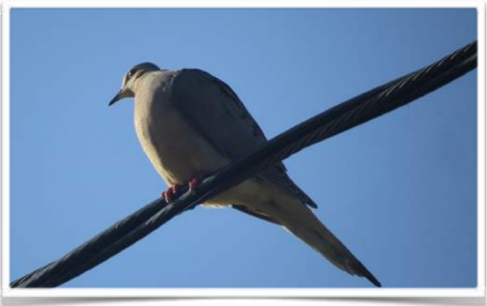
Mourning Dove On A Wire

After driving higher up Busch, we spotted bird #5 , a California Towhee , followed by the Pinecone Bird, which as many birders know, is a variant of the Lesser Leaf Bird. These uncountable “birds” were followed by species #6 , the European Starling . We