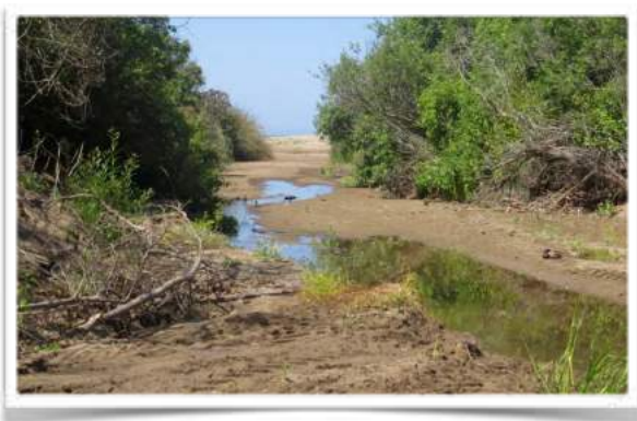
Zuma Creek Looking Toward Lagoon and Ocean

west bank. We turned around and headed back to Westward Beach Road, where we walked toward the beach. Looking up toward the Stump Lookout from Westward Beach Road an Anna's Hummingbird, #37 , rested on a laurel sumac shrub. A