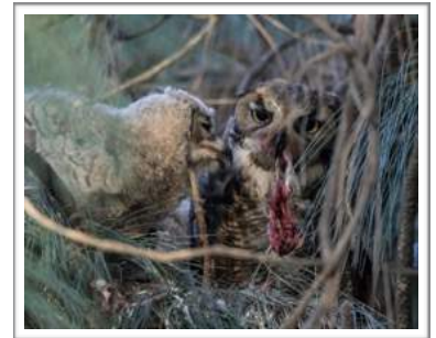
Snacking on a gopher

Woodley Park, home of the Sepulveda Basin Wildlife Reserve, has large trees in a park setting, plus a zillion gophers, thus has at least one breeding pair per season. Nesting starts late in the year; because chicks grow large before going solo, it takes time and a lot of food to raise them. Most of the time it's fairly unusual to spot a GHOW sleeping the day shift, hidden high in a tree. But when raising two, three, or four babies to full size, it's harder for them to remain out of view — which is a boon for birders and photographers.