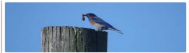
Western Bluebird with Yummy Bug

We saw a flock of swallows flying over a field. After getting out of the car for a closer look, we realized there were two species: Violet-green Swallow, #20 , and Cliff Swallow, #21 . Driving farther through the neighborhood, we found species #22, Western Bluebirds , the second of our "eating" birds.