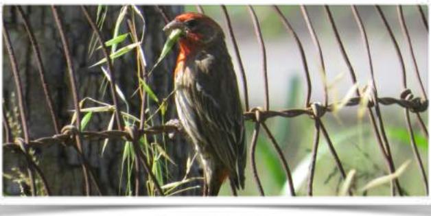
House Finch Eating Wild Oat Seeds

As we walked to the car, we added #29, a Common Raven . It was soaring high in the sky. Allan took a photo of a male House Finch eating, our third and final photo of birds "chowing down."