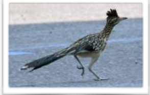
Greater Roadrunner in hotel parking lot

Tanagers, Vireos, and Dusky Flycatchers than I have ever seen, and five life birds for me. After leaving the ski area, we drove over to the Valles Caldera, a massive meadow covering the mouth of an extinct volcano. Later that evening, the entire WFO group went to the reception at the