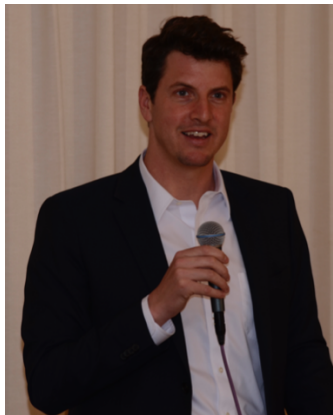
California State Senator, 27 th District, Henry Stern